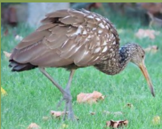
New Jersey's first ever Limpkin was spotted in Wall Township in November 2023.

There has been an explosion of Limpkin sightings throughout North America, well out-of-range from its usual Florida and points south. In addition to Florida, the species has been sighted in at least 26 US States plus 2 Canadian Provinces. (SC MS MD NC TN VA OH OK TX AL AR MN IL CO OK KS NE IA WI IN KY GA WV PA NJ MI and NS ON)