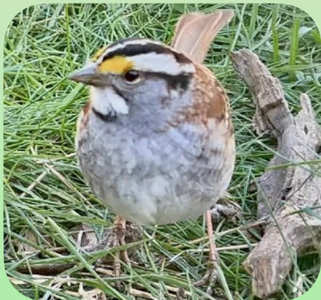
White-throated Sparrow - one of the many beautiful harbingers of Winter

For a complete list of species observed on the big day, see page 6.